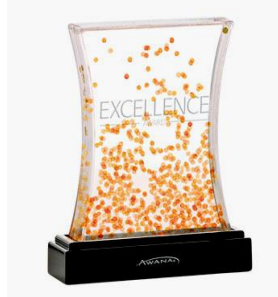
2 nd book Excellence