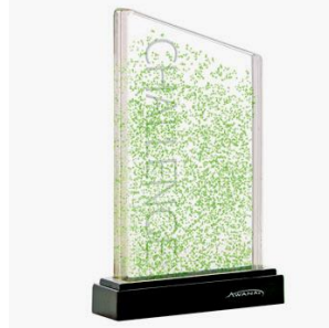
3 rd book Challenge