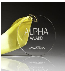
1 st book Alpha