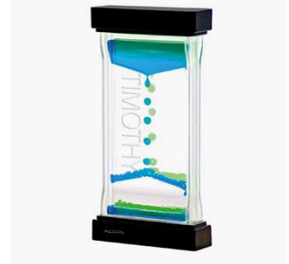
4 th book Timothy